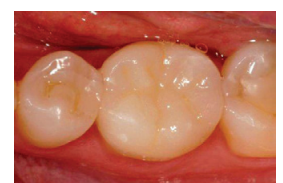
Silver fillings replaced by porcelain Inlays/Onlays